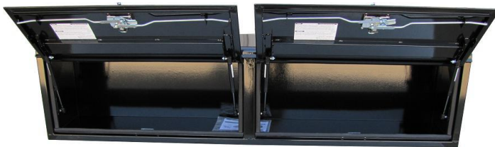
Top Hinged Bottom Open