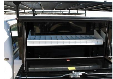
Optional Shelf Shown