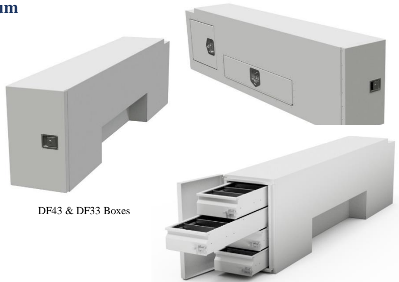
DF43 & DF33 Boxes