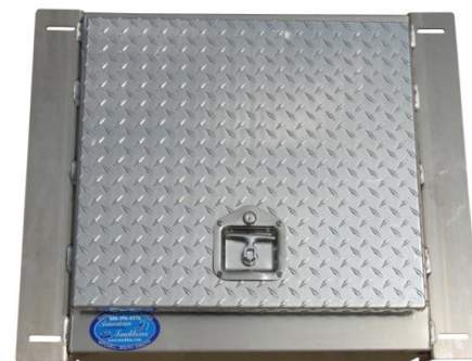
AIFB5T = T-Handle locking