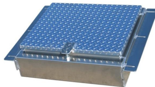
AIFB5B = Pad Lock locking