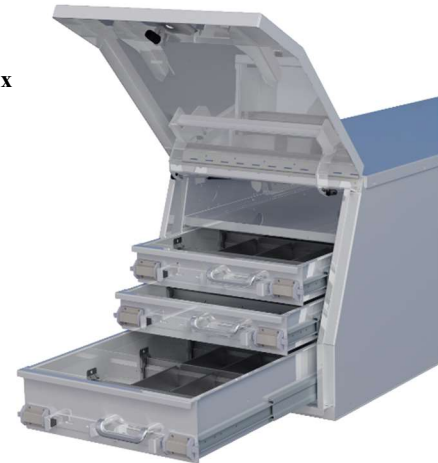
CGD Boxes – Angled Box Mates with DU41 Boxes