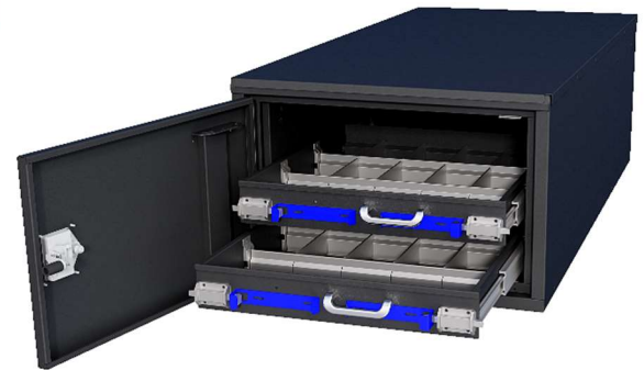
CRD41 & CRD51 Boxes

Note: *Boxes are available in: Black (B) and White (W) Finish – add after part number.