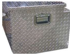
End View Showing Inset (Offset) and with Optional Handle