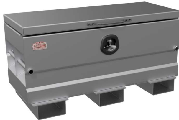
Shown without Slots