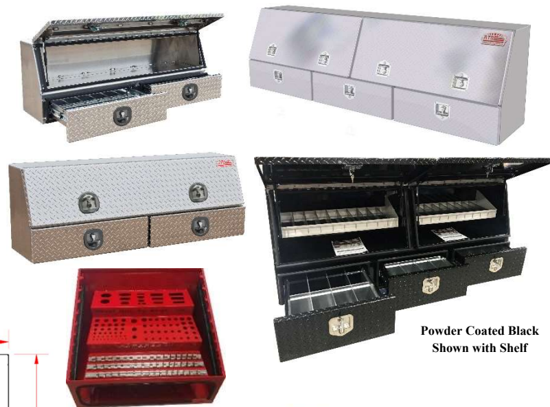
Powder Coated Black Shown with Shelf