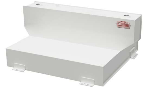
TL42 & TL52 Tank