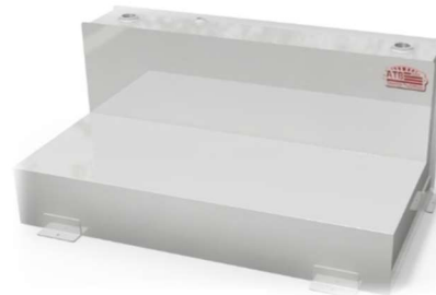
TL41 & TL51