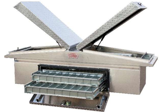
With Option Drawer(s)