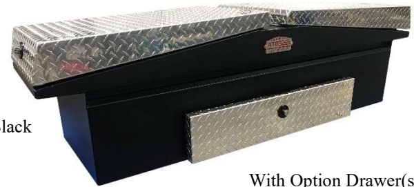
Powder Coated Black