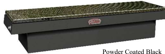
Powder Coated Black