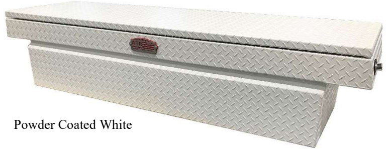
Powder Coated White