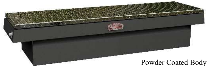
Powder Coated Body