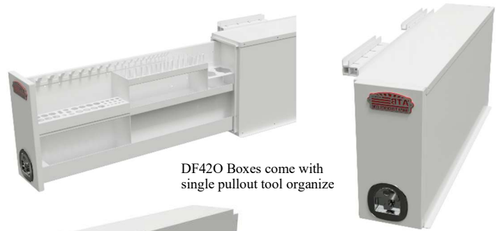
DF42O Boxes come with single pullout tool organize