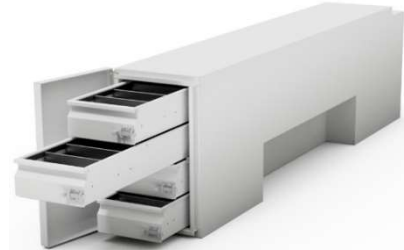
Note: *Add L-Left (driver) or R-Right (passenger) Drawer configuration.