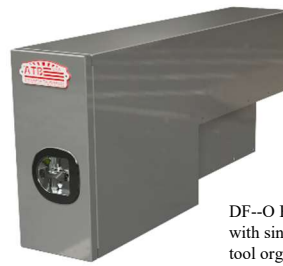
DF--O Boxes come with single pullout tool organizer