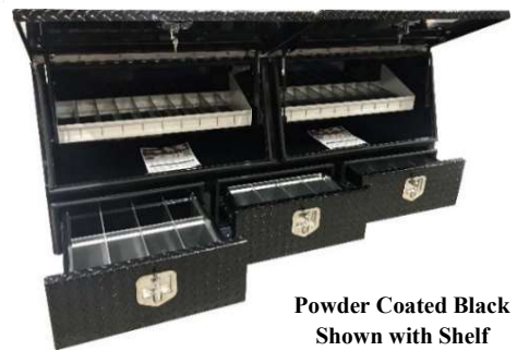
Powder Coated Black Shown with Shelf