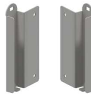
Left - Right