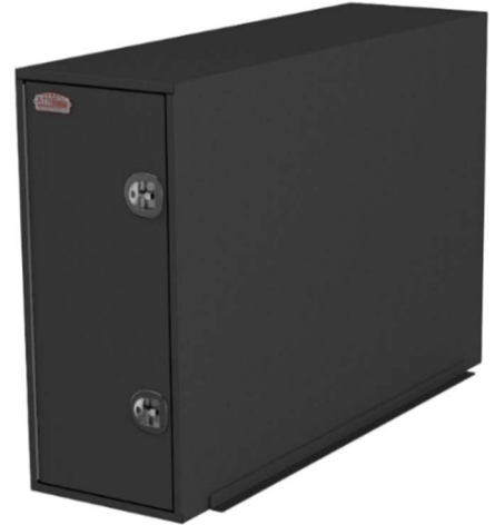
Single Door (Standard)