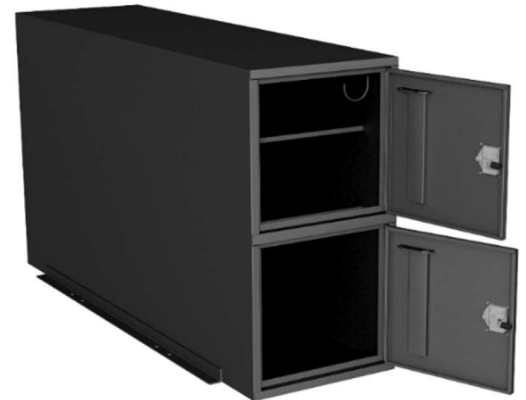
Double Door (Optional)

Note: *Boxes are available in: Black (B) and White (W) Finish – add after part number.