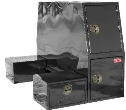
Shown with Optional Service Boxes