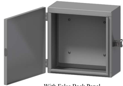
With False Back Panel