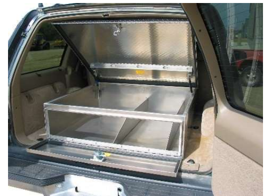
Shown with optional compartment dividers