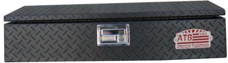
SC31 Front Box