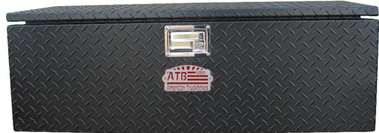
SC32 Rear Box