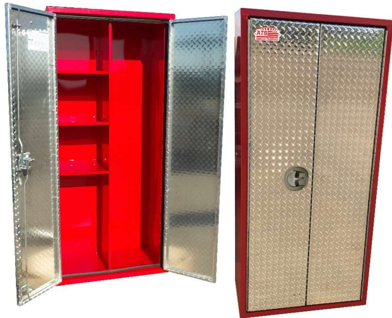
AGC41-651830DD-SOT Powder Coated Red