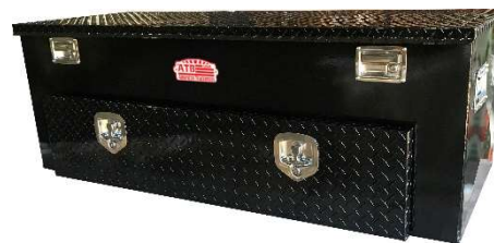
ATC41P Powder Coated Black