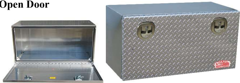
Diamond Tread Door