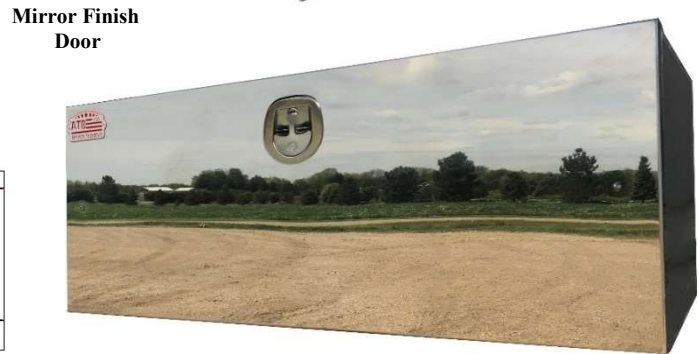
Mirror Finish Door