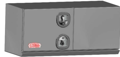
A-UG52 Smooth Reinforced Bottom

Note: Box door is available in: Smooth (S) or for Diamond Tread (T) and Mirror (M) - change end of part number. Boxes can be ordered in Left or Right configuration.