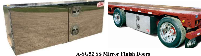
A-SG52 SS Mirror Finish Doors