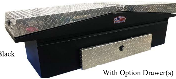
With Option Drawer(s)