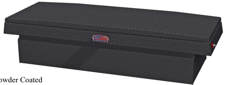
Powder Coated BX-Black