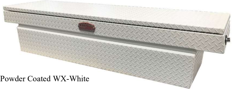
Powder Coated WX-White