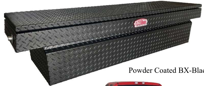
Powder Coated BX-Black