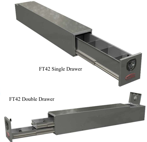
FT42 Double Drawer