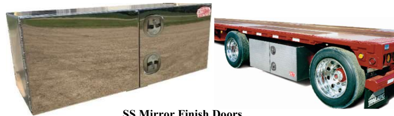
SS Mirror Finish Doors