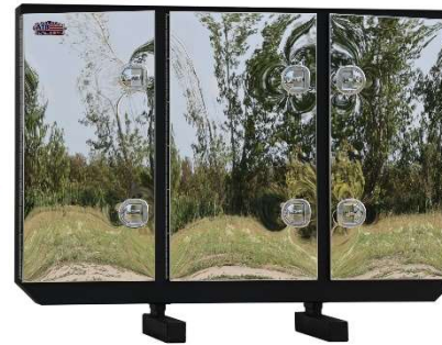
Mirror Finish SS Doors