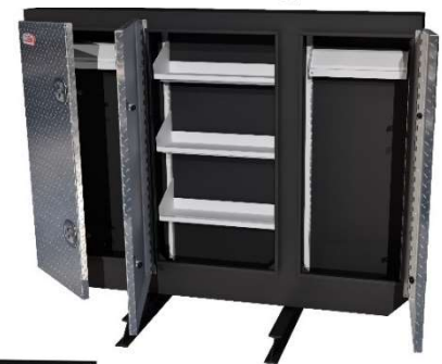
Powder Coated Body