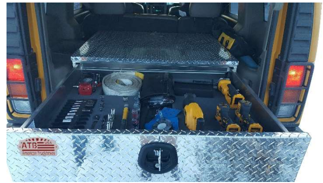
A-BPS41-123644 Trunk Box