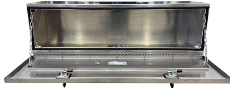
Mirror Finish Door